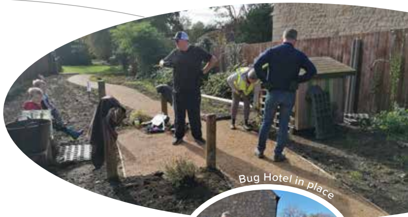
Bug Hotel in place

WPC will continue to work with all developers for the benefit of this parish.